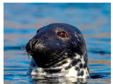
Grey seal.

Keep up to date with news & special offers at www.wild-scotland.co.uk